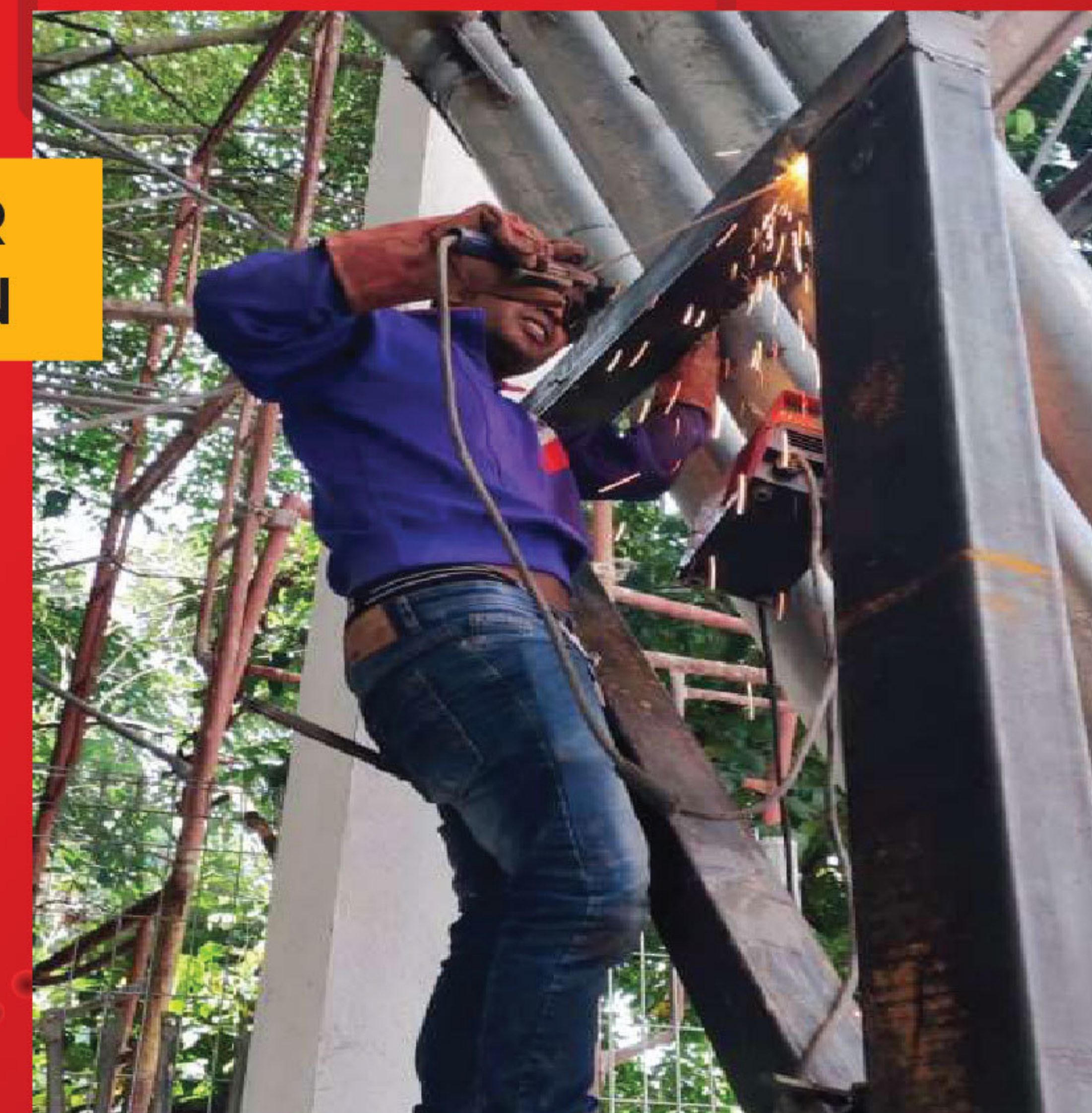
CABLE LADDER CONSTRUCTION