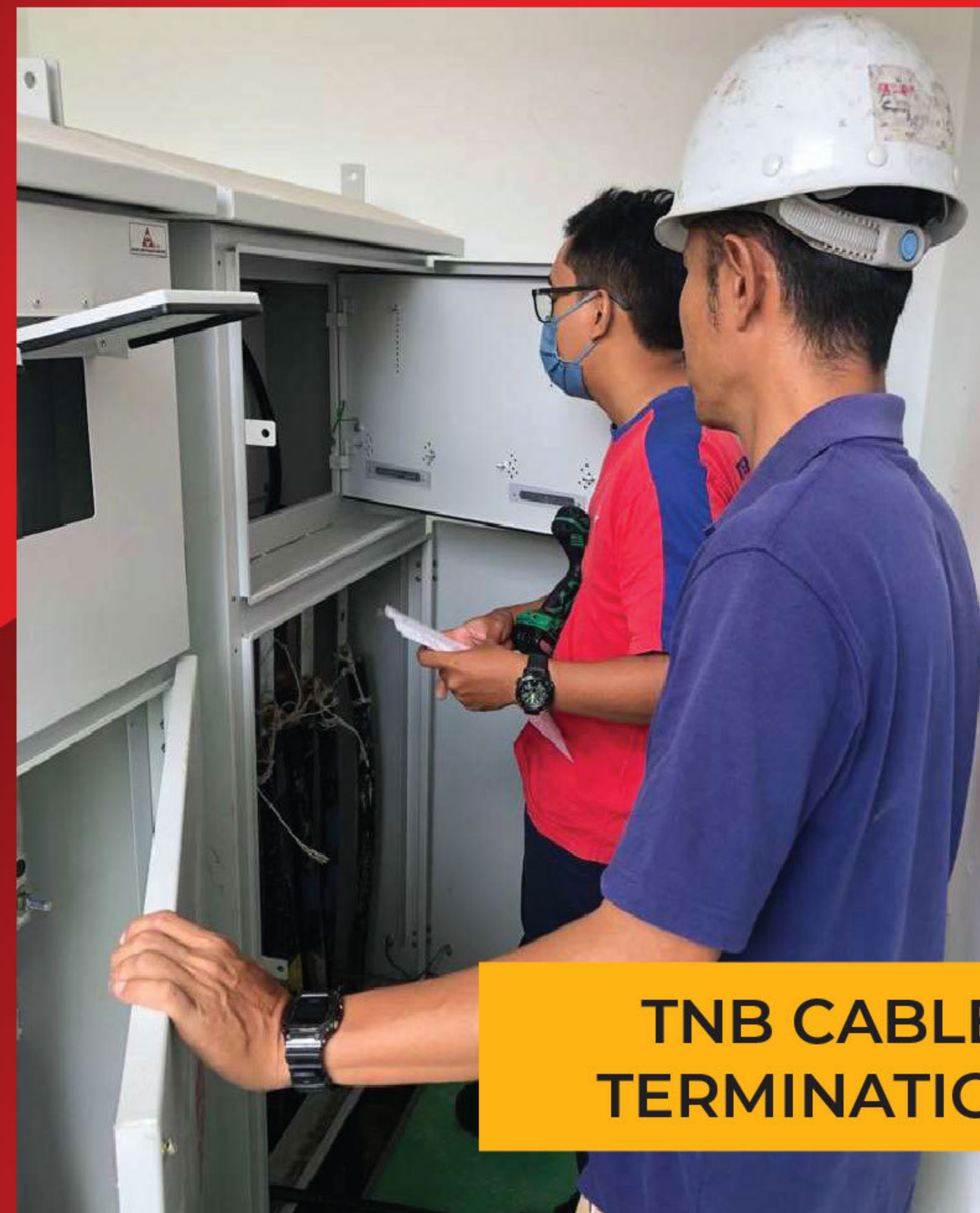
TNB CABLE TERMINATION